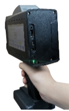
Compact design, easy handling

Two stitched print heads with print height up to 50 mm and max 20 lines.