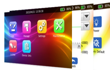
5"HD touchscreen with a simple and intuitive software

One printer for dual use. Take in hand for mobile coding and mount on production line for auto coding.